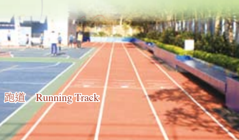
跑道 Running Track