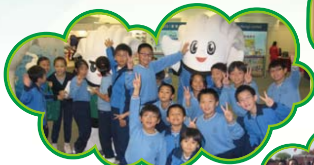
觀賞香港東亞運動會比賽 Students watched the competitions of the Hong Kong 2009 East Asian Games