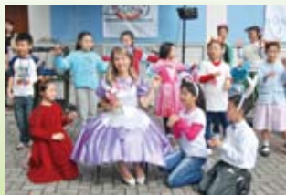
英語活動日 —— 愛麗斯夢遊仙境 English Day - Alice in Wonderland