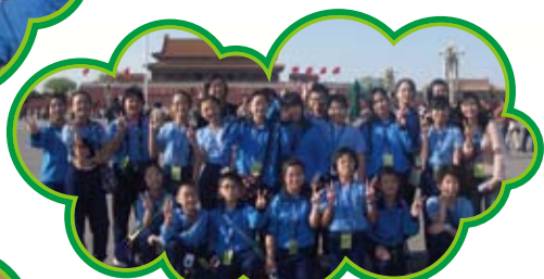
赤子情·中國心——北京之旅 The visit to Beijing