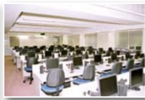
多媒體教學室 Multi-media Teaching Room