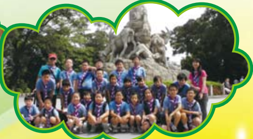
廣州之旅 The visit to Guangzhou