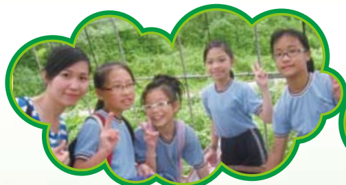
參觀綠田園 The visit to the Produce Green Foundation