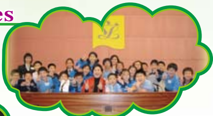
參觀立法會大樓 The visit to the Legislative Council