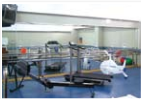
健身室 Physical Fitness Room