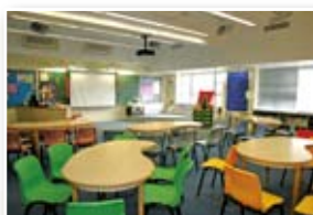
英語活動室 English-Language Activity Room (English Kingdom)