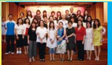
家長教師會 Parent-Teacher Association

本校已成立家長教師會及法團校董會，透過每年三次的法團校董會會議，定期舉辦家長會、家長講座、親子戶外學習日、校長與家長閒談會等活動，促進學校與家長的聯繫。此外，本校家長積極參與義工服務。