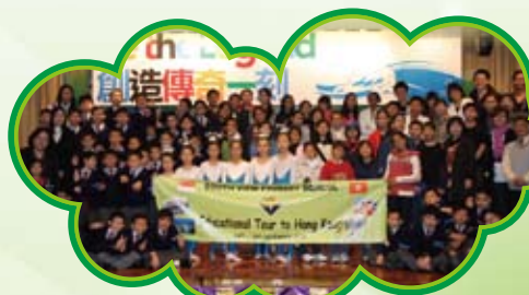
新加坡小學師生到訪本校 South View Primary School (Singapore) visited our school