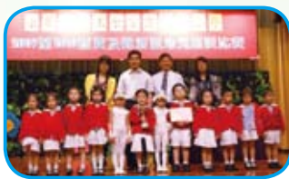
西貢及觀塘區幼兒朗讀比賽 Reading Aloud Competition for kindergarten students