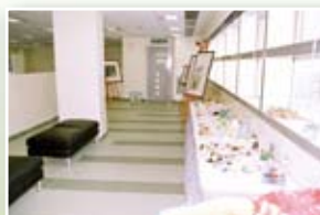
賞藝廊 Art Gallery