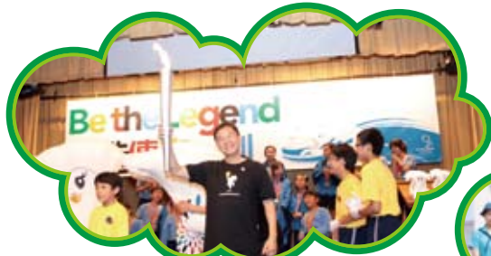
參與東亞運動會校內火炬接力傳遞 The inter-school Torch Relay of the Hong Kong 2009 East Asian Games