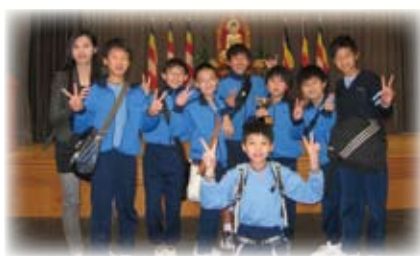
參與西貢區小學遊蹤大賽 Take part in Primary Schools Math Trail Competition (Sai Kung)