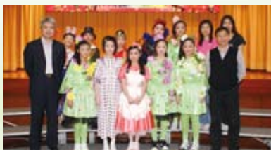
聯校英文綜合表演 Joint Primary Schools English Variety Show

Create an English-rich environment by fun activities, such as English Day and Christmas Carnival.