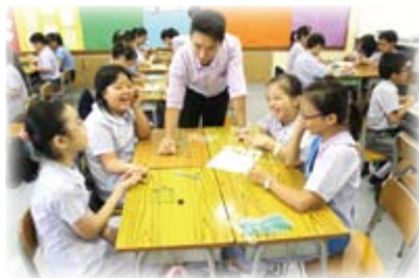
積極參與課堂活動 Active participation in learning activities