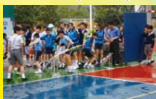
製作水火箭 The making of water rockets