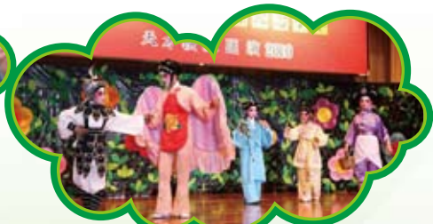
天才橫溢匯演 The Variety Show