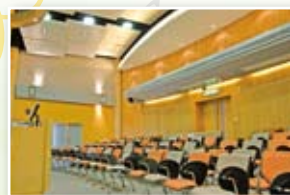
演講廳 Lecture Theatre