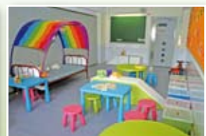
遊戲室 Games Room