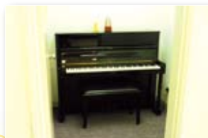
四個鋼琴室 4 Piano Rooms