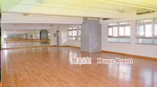
舞蹈室 Dance Room