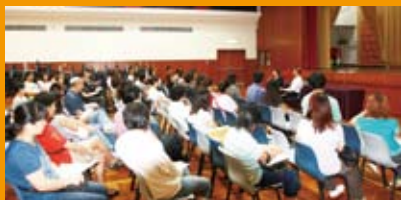
校長與家長閒談會