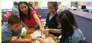
專題研習課 Project learning