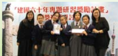
參與「建國六十年專題研習獎勵計劃」 Take part in 60 th Anniversary of the Founding of the People's Republic of China - Project Learning Award