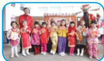
中國文化日 Chinese Cultural Day