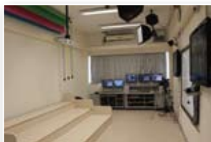
遠程教室 Distance Learning Classroom