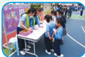
普通話活動 Putonghua activities

Expose students to understand more about the culture of China, Chinese Cultural Day is organized annually with different themes e.g. Chinese Opera, Chinese calligraphy, Chinese cuisine etc.